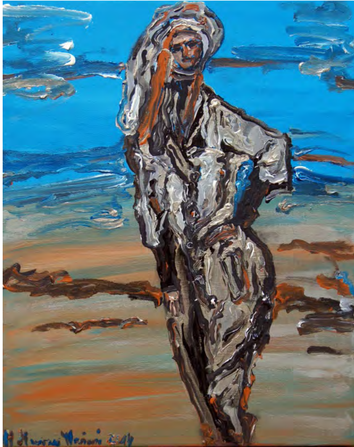
Alone in the Desert , 2014, acrylic on canvas, 19.7" x 15.7"