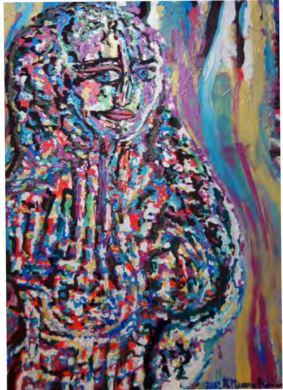
Sorrow , 2012, acrylic on canvas, 40" x 30"