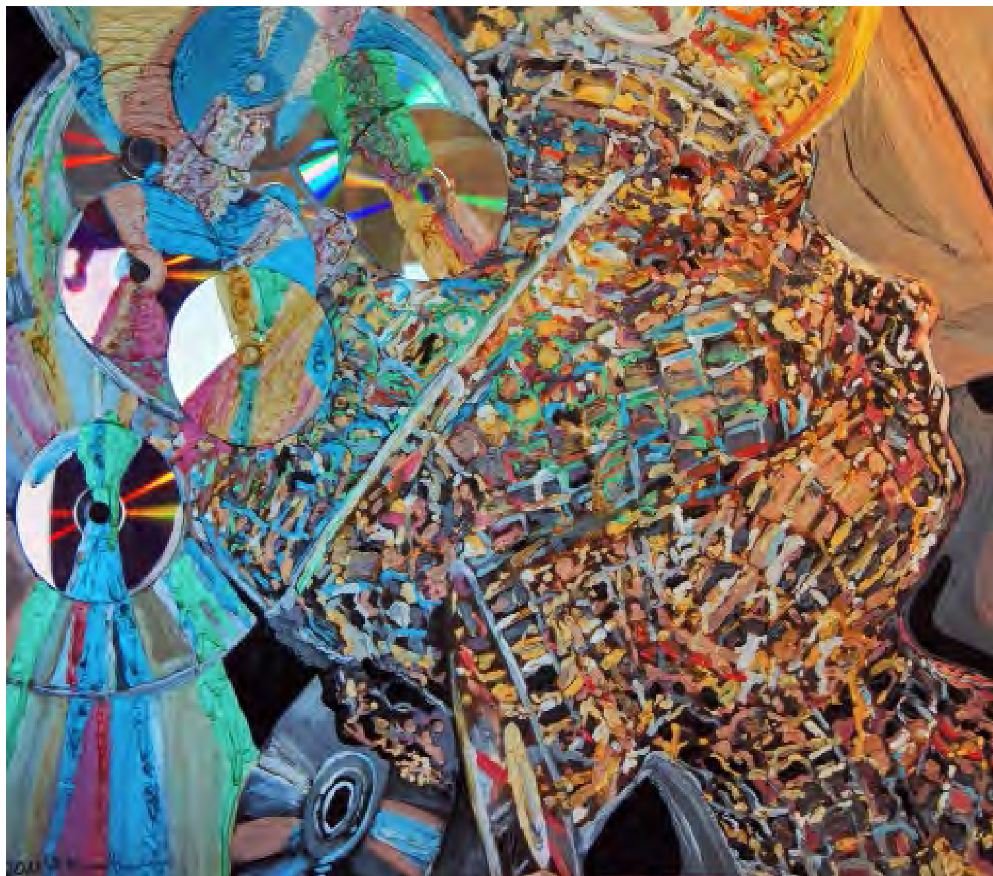
Brainstorming , 2011, acrylic, mixed media on canvas, 23.5" x 31.5"