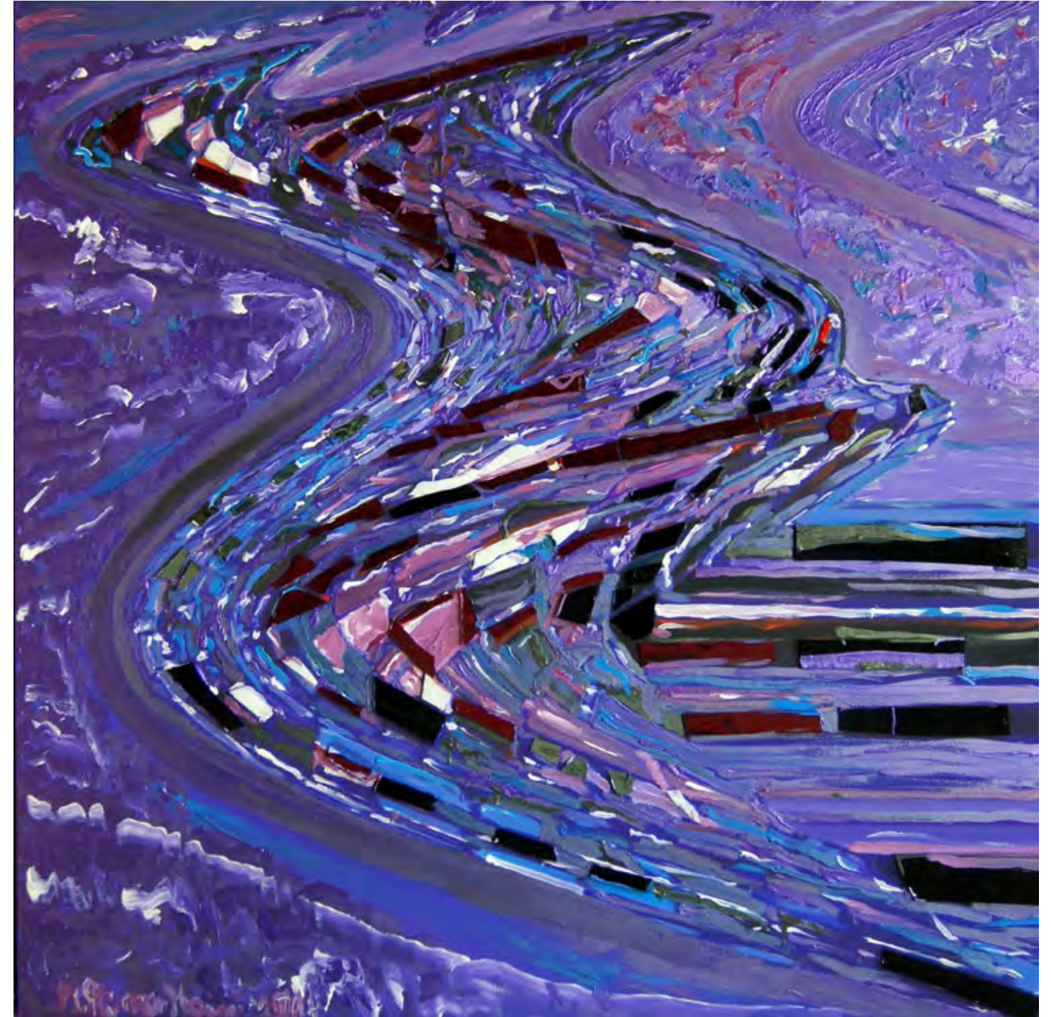
Flash Birds , 2014, mixed media on canvas, 35.5" x 35.5"