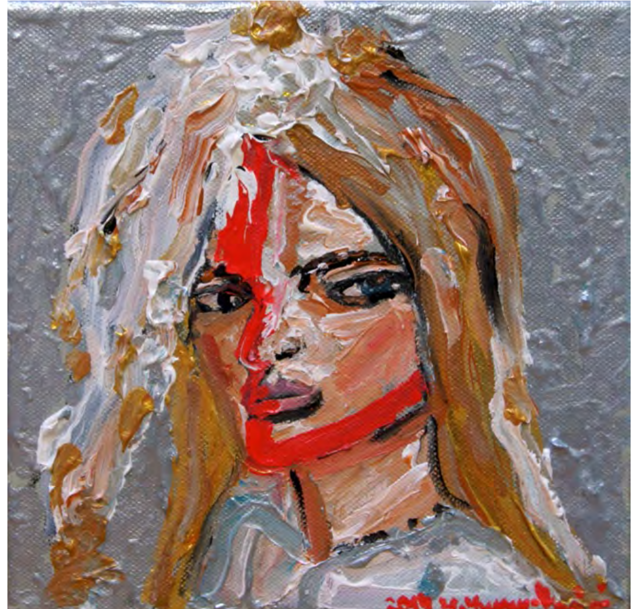
Why , 2014, acrylic on canvas, 7.9" x 7.9"