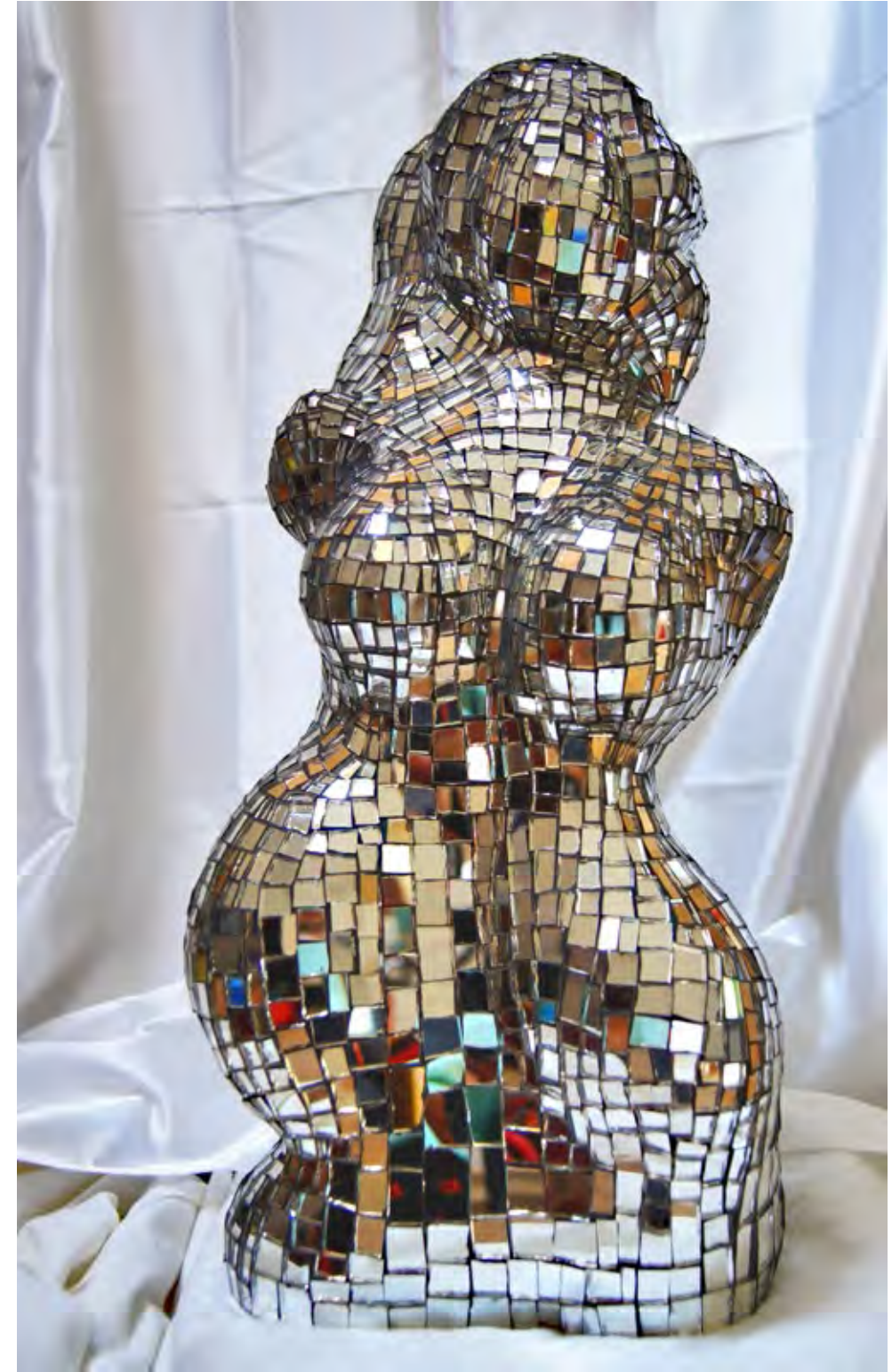
Cortesy of Jadelynn , 2013, mixed media, morror fragments, 15.3"x 3.1"x 7"