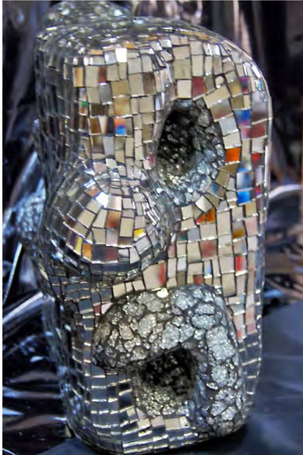
In Bocca al Lupo , 2012, mixed media, mirror, 15.75" x 14.95" x 6.7"