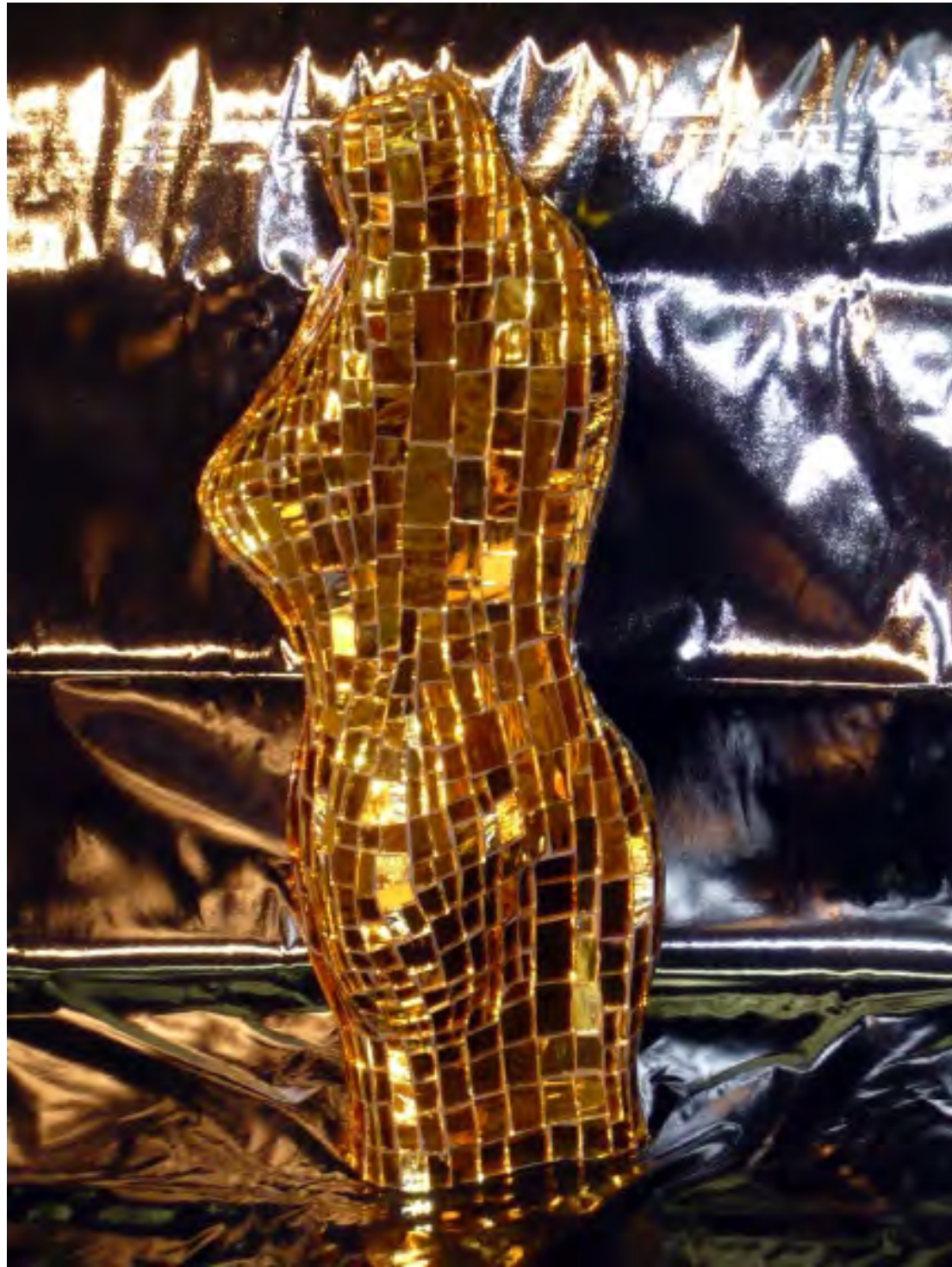
Torso Gold , 2010, mixed media, mirror, 19.7" x 7.9"