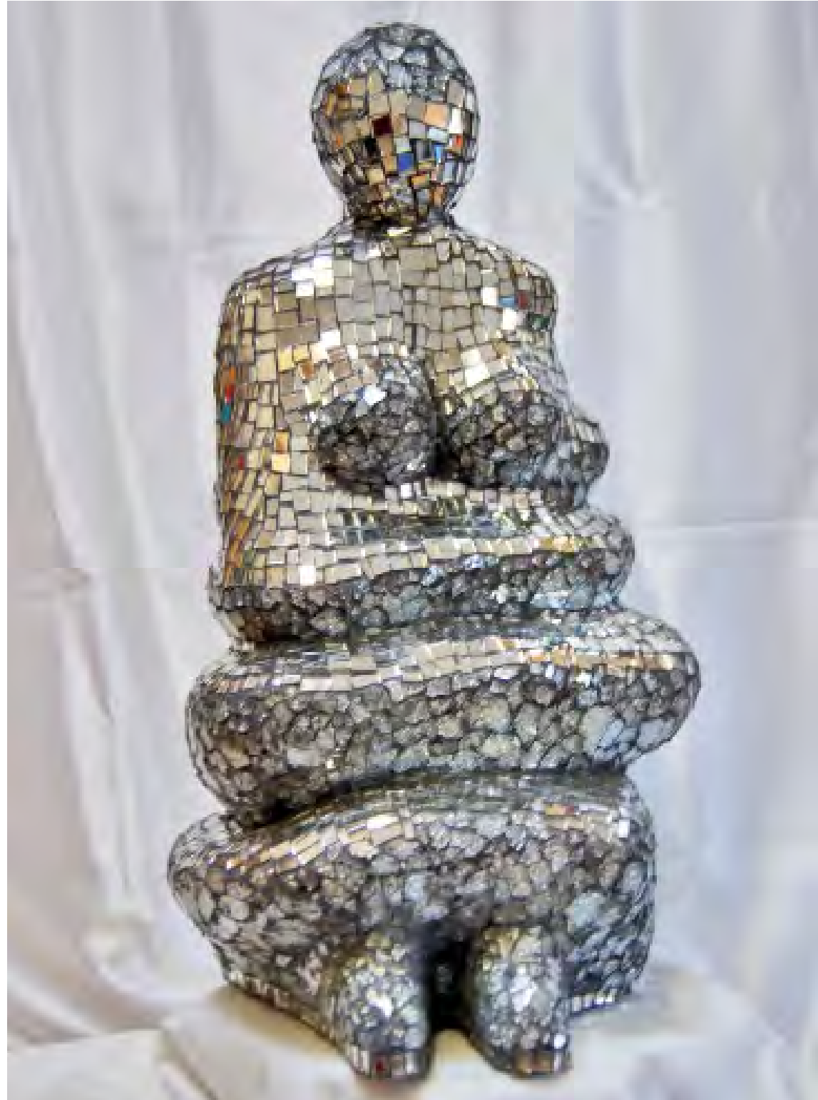
Rotella , 2015, mixed media, morror, 19.7" x 11.8" x 9"