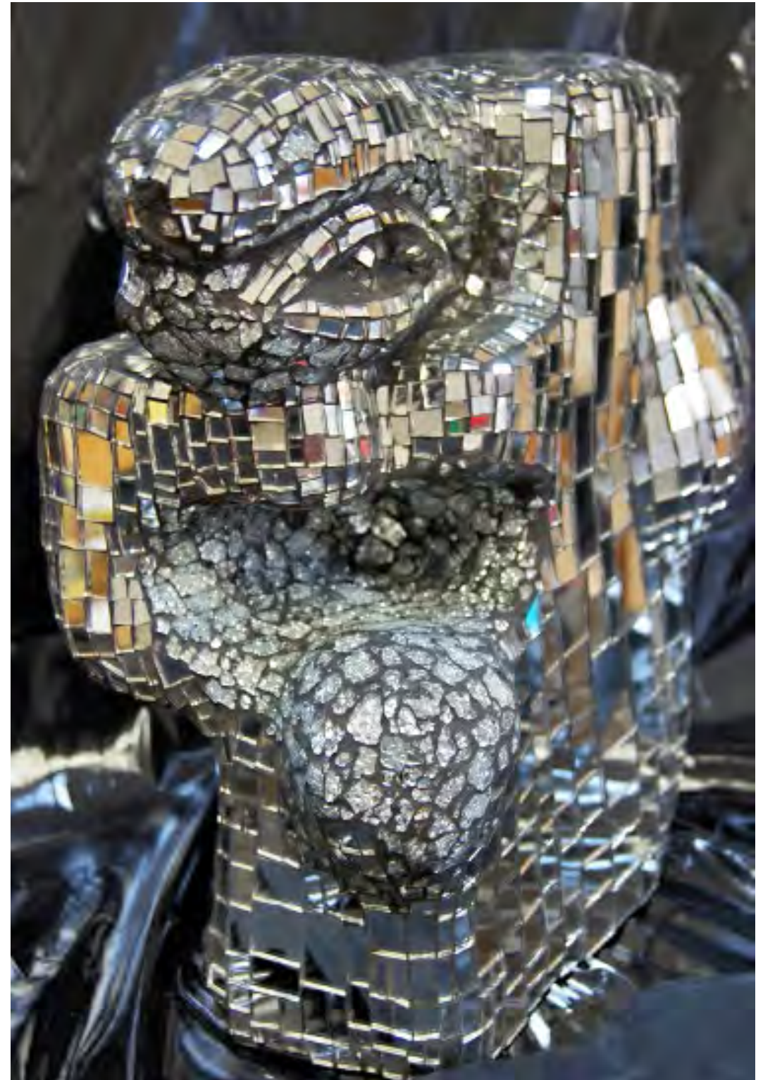
In Bocca al Lupo , 2012, mixed media, mirror, 15.75" x 14.95" x 6.7"