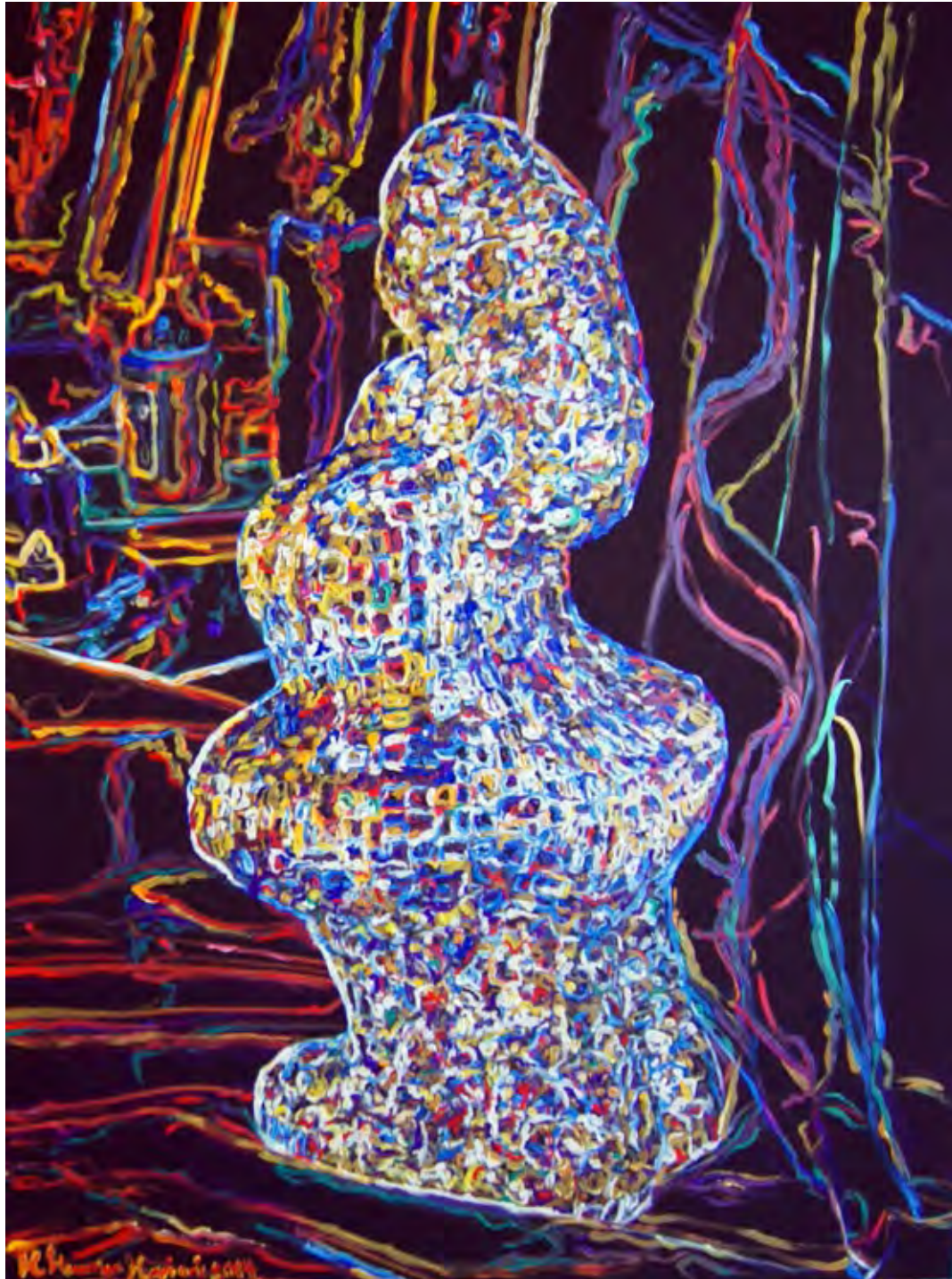
Alice in Wonderland , 2015, acrylic on canvas, 40" x 30"