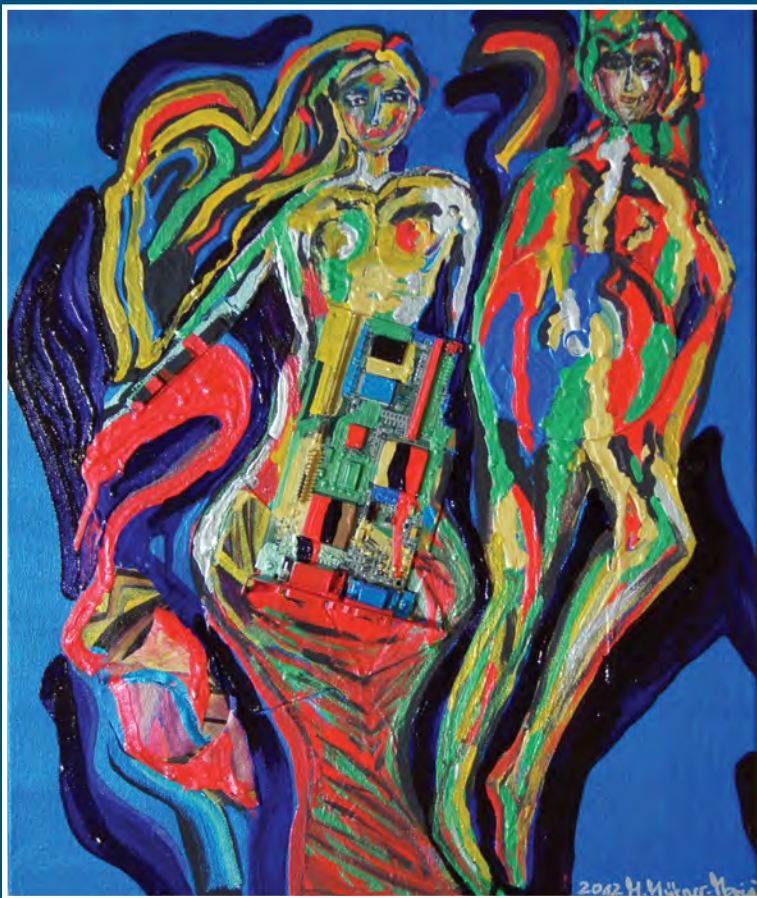
"Fashion Show" Acrylic and Mixed Media on Canvas, 21.5" x 18"

These compositions are crisply articulated kaleidoscopic homages to the mosaic art form originating in Ancient Greece through Byzantium, and are joyously graced with a strikingly sonorous spectrum of color. Ms. Marioni's work investigates the body by abstracting and fragmenting the human figure through mosaic application of industrial materials. Her work extends beyond her compositions by engaging the actual body in space through the addition of reflective surfaces. Our natural bodies are juxtaposed to the fragmented figures and even become complicated additions to the industrial compositions. Varied interpretations emanate as her work elicits a myriad flow of visceral responses from the viewer.